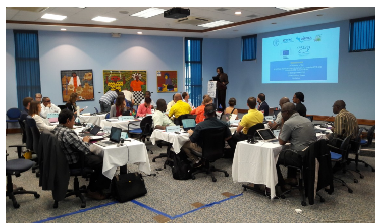
Participants at Second Meeting of RWG-IUU

Working Group (RWG-IUU 2), held in Barbados from 19-21 September 2017, addressed the WECAFC Programme of Work and provided some necessary regional-level follow up to the Meeting of the Global Record informal open-ended technical and advisory working group (Rome, 23–25 February 2015). More specifically, the Meeting developed draft WECAFC recommendations on: establishment of an Authorized The practical implementation of the FAO Port State