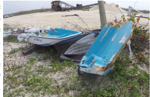
n e g a t i v e l y Destroyed vessel, River Wharf, Barbuda impact fisheries' GDP for 2017 and 2018.

losses . The damage to 68.5% of the active fishing fleet in Barbuda and 44.4% of the estimated 4,899 traps in operation is expected to n e g a t i v e l y