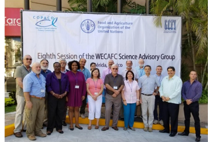
Participants of the 8<sup>th</sup> SAG session, Nov 3-4, 2017

presumed and/or confirmed to have carried out IUU fishing in the WE-CAFC area. Recommendations were also made regarding billfish management and conservation. and improving the sustainability of