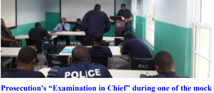
Prosecution's "Examination in Chief" during one of the mock trials. Barbados' Senior Crown Counsel and Officer-in-Charge RBPF Marine Unit look on.

This course was jointly funded by the European Union through the 10<sup>th</sup> EDF Project and RSS Headquarters. At the course's closing ceremony, the EU Representative affirmed the commitment of EU to strengthening law enforcement in the Caribbean; in also emphasising the importance of participants sharing what they learnt with colleagues in their home countries; thus, contributing to the development of a cadre of efficient and effective fisheries prosecutors in the region.