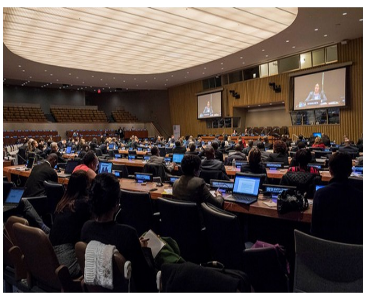
The high-level meeting organized by CARICOM and the US

Several Caribbean countries have been recently devas- Preliminary damage estimates for Dominica's fishertated by two catastrophic hurricanes, Irma and Maria. ies sector stood at roughly US$3 million. The initial At the 7th Special Meeting of the CRFM Ministerial assessment for Antigua and Barbuda stood at just over Council, hosted in Georgetown, Guyana, on 5th Octo- US$316,000, with an estimated 778 individuals af-CARICOM Member States to move ahead with adopt- pendents; accounting for 25.5% of the population of ing risk insurance that would enable the fisheries sec- Barbuda and 0.3% of the population of Antigua. These tor and fishers to bounce back more quickly after a numbers reflect damage mostly to fishing boats and hurricane strikes. The recent devastation underscored equipment, as well as infrastructure vital to the sector; the need for Member States of the Caribbean Regional but do not include damage to marine ecosystems and Fisheries Mechanism (CRFM) to press forward with habitats (coral reefs, mangroves etc.) or impacts on the risk insurance for the fisheries sector-currently being fish stocks themselves. Many fishing communities aldeveloped by the Caribbean Catastrophe Risk Insur- ready subsist in precarious and vulnerable conditions ance Facility Segregated Portfolio Company (CCRIF because of poverty and rural underdevelopment, and SPC) in collaboration with the World Bank. This ini- there is need for adaptation to secure a more resilient